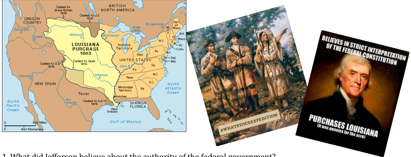
Station #2: The Louisiana Purchase